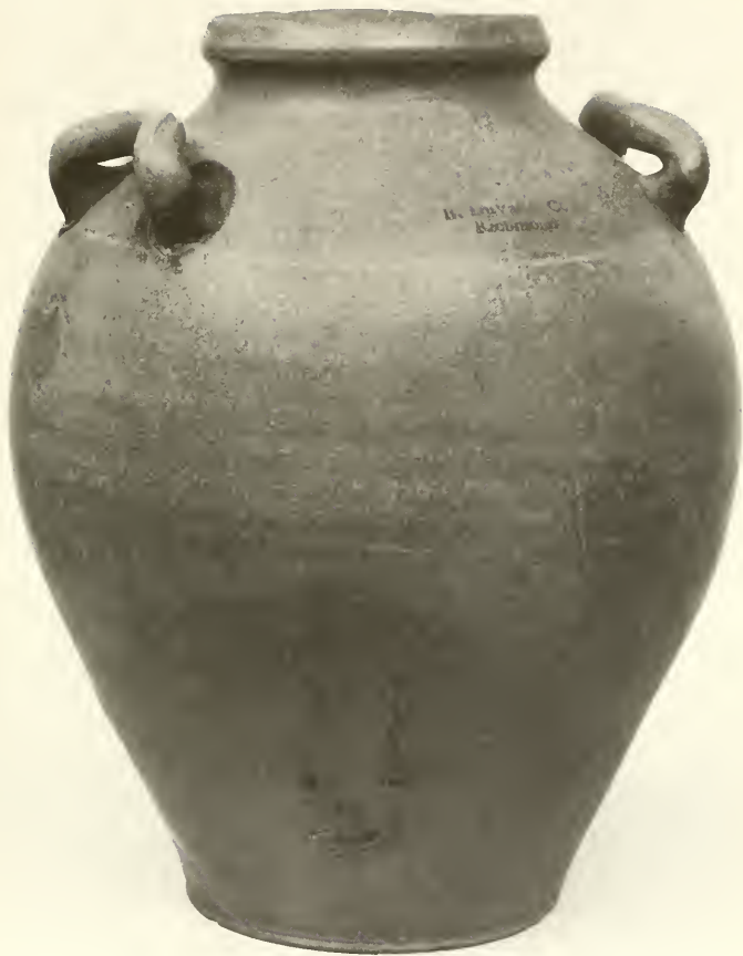
Jar by Richmond Stoneware Manufacturing; stoneware; Richmond, Va.; 1815-1817. HOA 15 \frac{5}{8} "; DIA at rim 5 \frac{3}{4} ". MESDA acc. 2950.